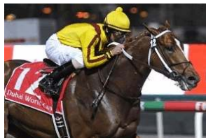
Curlin