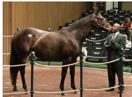
Wine and Dyne