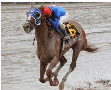
Summer Bird