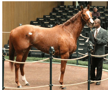
Lady Alexander