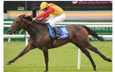
Snow Fairy

Snow Fairy's third dam Persian Fantasy, a 1 1/2-mile winner who was listed-placed over two miles, visited Red Ransom's son Sri Pekan with success. Their son Persian Lightning was a smart and durable performer at around a mile and a quarter. Incidentally, Sri Pekan's record was similar to Intikhab's in that he, too, had more fillies than colts among his stakes winners.