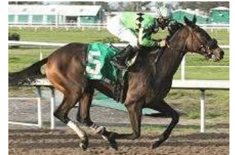
Get Ready Bertie