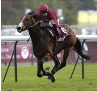
Paco Boy (Ire) www.goffs.com

Goffs' three-day November Foal Sale at The Kill starts today, with 694 lots catalogued, including a selection from the first crops by some of Europe's most exciting