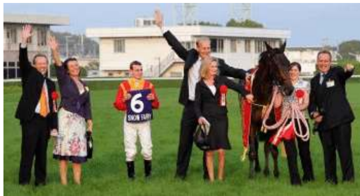
Snow Fairy and connections in Japan