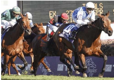
Cartier Horse of the Year Goldikova