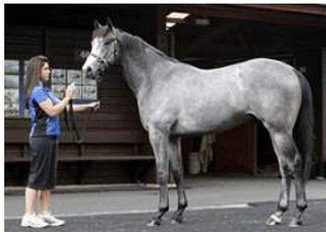
Fusaichi Pegasus colt - Lot 52 www.nzb.co.nz

A colt by Fusaichi Pegasus provided an early highlight to an otherwise mixed day's trade at the first session of New Zealand Bloodstock's 2010 Ready to Run Sale of