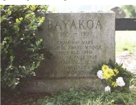
Bayakoa's grave at Pennbrook