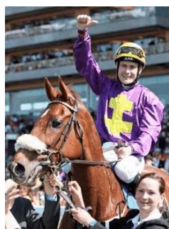
Rite of Passage

Unbeaten ☆ "TDN Rising Star" ☆ and leading Classic contender Frankel (GB) (Galileo {Ire}), winner of the G1 Dewhurst S. and G2 Royal Lodge S., took the two-year-old colt award. Trained by Henry Cecil, the bay colt is a Juddmonte homebred, as is Workforce.