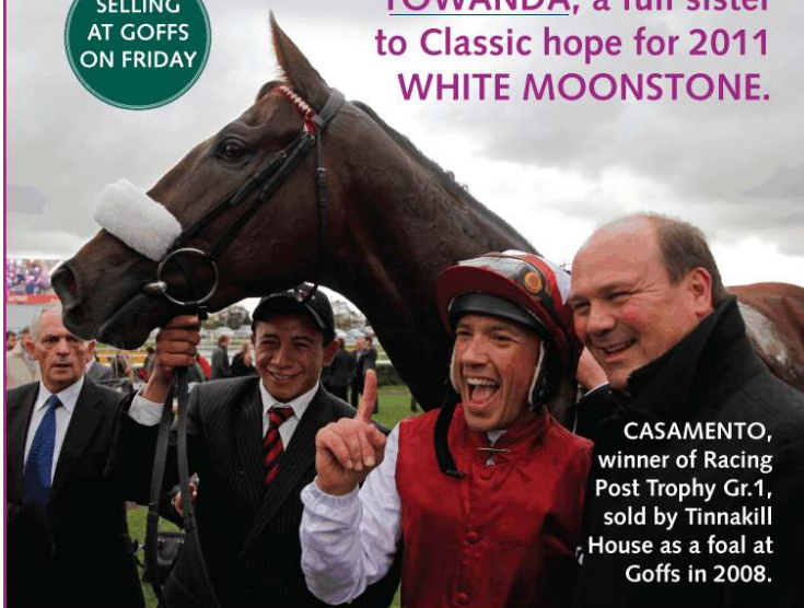
CASAMENTO, winner of Racing Post Trophy Gr.1, sold by Tinnakill House as a foal at Goffs in 2008.

Breeders of CASAMENTO • ALEXANDER GOLDRUN • RED EVIE Tinnakill House, Coolrain, Mountrath, Co.Laois, Ireland • Tel: +353 57 8735961