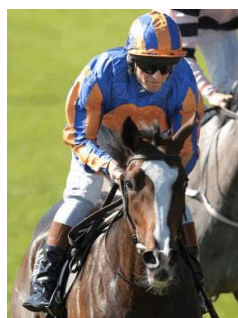
Misty for Me