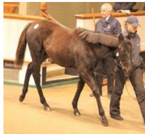
Lot 1034 tattersalls.com