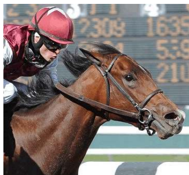
Buffum