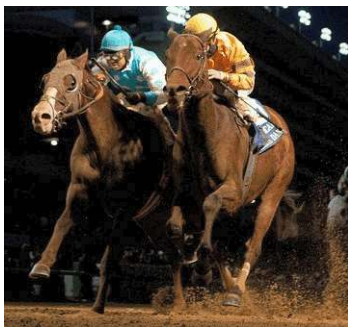
Giant Oak (left)

He was winless in 14 starts since taking the Arlington Classic in May of 2009, but Giant Oak (Giant's Causeway) joined the ranks of Grade I winners with the help of the stewards, getting moved up to first in yesterday's GI Clark H. at Churchill Downs. The unofficial winner, Successful Dan (Successful Appeal) bumped show horse Redding Colliery (Mineshaft) several times when trying to shift out for running room in the lane. He drove to the front and outgamed Giant Oak by a head, but was demoted to