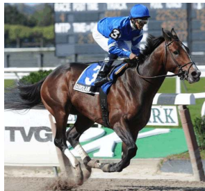
Girolamo

Girolamo looked an absolute picture before the Nov. 6 GI Breeders' Cup Sprint, but the Godolphin runner was never a factor and came home 11th as the 4-1 favorite that day. Stablemate Vineyard Haven fared