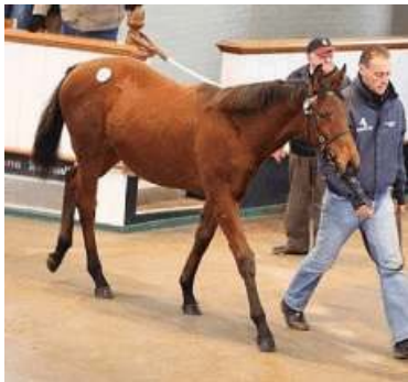
Lot 833