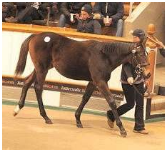
Lot 979