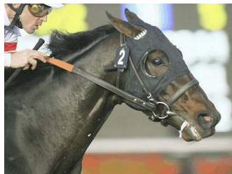
Court Vision