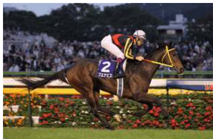
Buena Vista

Vodka (Jpn) (Tanino Gimlet {Jpn}) struck for the fairer sex in last year's renewal, and Buena Vista will likely go favored to make it two straight for the girls. Runner-up by 3/4 of a length in the G1 Dubai Sheema Classic in March, the homebred filly returned home to defeat her peers in the G1 Victoria Mile May 16, then missed by a half-length