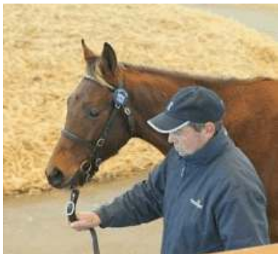
Lot 1131 tattersalls.com

Nothing yesterday challenged Friday's 320,000gns top-priced Singspiel (Ire) colt with a 200,000gns Tamayuz (Ire) half-brother to G1 Prix de l'Abbaye winner Total Gallery (Ire) (Namid) heading the billing. Offered by Coleman Stud, who sell his dam Diary (Ire)