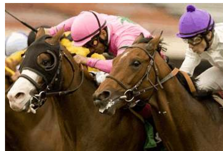
Fantastic Pick (left)

Sebastian Flyte , group-placed in England and Ireland, ended his European stint with a third in handicap company at Leopardstown in June. The chestnut opened his U.S. account with a win in an optional claimer going a mile at Del Mar Sept. 4. Let go at 8-1 in the Oct. 16 GII Oak Tree Derby at nine panels, he came running late to be fourth, just 3/4 of a length behind