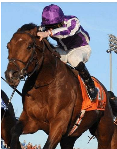
Joshua Tree

spent the late summer and early autumn in France. Narrowly runner-up in the G2 Prix Foy Sept. 12, the four-year-old held the call inside the final quarter-mile of the G1 Prix de l'Arc de Triomphe Oct. 3, but was run down late by Workforce (GB) (King's Best). The lightly raced Joshua Tree looks the best of the foreign contingent. A Group 2 winner as a juvenile, the bay was a one-paced fifth in the G1 St Leger S. Sept. 11, but was good enough to score by a head from Mores Wells in the G1 Canadian International S. at Woodbine Oct. 16.