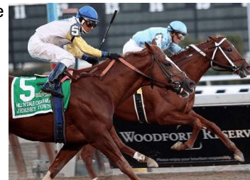
Jersey Town (#5) edges Haynesfield