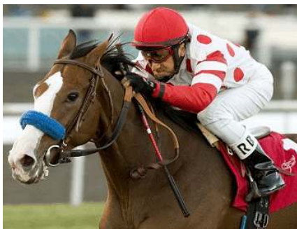
Neversaidiwassweet

(Edited press release) Eurosilver (Unbridled's Song--Russian Tango, by Nijinsky II), sire of Sunday's GIII Miesque S. winner Neversaidiwassweet, has moved from Dromoland Farm in Kentucky to Pennsylvania's Penn Ridge Farms LLC for the 2011 breeding season.