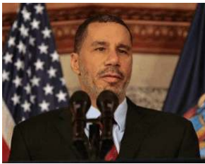
Gov. Paterson NY.gov

NYCOTB TOPS SPECIAL SESSION AGENDA The New York State legislature held a special session Monday at the request of New York Gov. David Paterson, in part to address the fate of bankrupt New York City OTB. In a proclamation released last week, Paterson announced that, "Enacting a plan to provide for adequate savings and implementation of other measures to allow for the continued operation of the New York City Off-Track Betting Corporation," was first on the agenda.