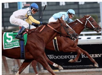
Jersey Town (#5) edges Haynesfield

Two of Speightstown's Grade I winners are out of non-winning mares, Lord Shanakill being out of an unraced daughter of Theatrical, and Mona de Momma from a Linkage mare that was unplaced. Haynesfield, though, is out of a graded-stakes mare, and there can be no complaints about the bottom half of Jersey Town's pedigree. His dam is that fine performer Jersey Girl, who helped earn her sire