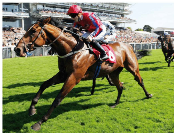
VITAL EQUINE, winner of the Gr.2 Champagne Stakes and 2nd in the Gr.1 2,000 Guineas. His dam sells as lot 1704.

Complete Dispersal of BREEDING CAPITAL PLC at Tattersalls December Sales