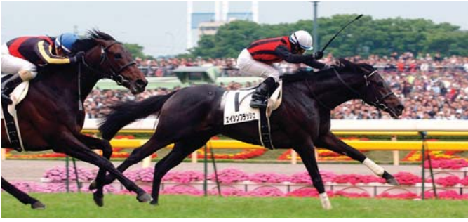
Eishin Flash (King's Best), sold in utero of his dam Moonlady at Tattersalls Dec. in 2006 by Loughbrown Stud for 315 000 GNS to Shadai Farm, wins the Group 1 Japanese Derby.