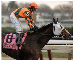
No Such Word Horsephotos