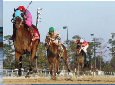
GOURMET DINNER (by Trippi) wins $1 million Delta Downs Jackpot S USA. Trippi's first South African yearlings will be offered in SA in 2011.