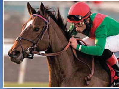
GYPSY'S WARNING (SAF) wins G1 Matriarch S in USA on 26 November 2010.