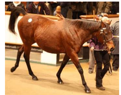
Danceabout - lot 1695 tattersalls.com

Referring to her foundation mare Mrs Moss, the granddam of First whom she purchased in 1975 and who is commemorated in bronze at the stud, she continued, "It's not bad, 2,100gns to 1.1 million in 35 years, is it? I was very lucky to buy her, and I've got a lot of her family in Australia and New Zealand still--I couldn't live without