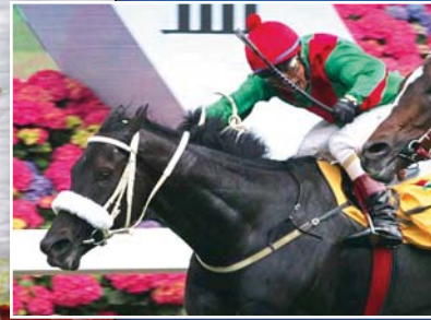
IRRIDESCENCE (SAF) - heroine of the HK$14 million QE II Stakes G1 in Hong Kong, defeating OUIJA BOARD .