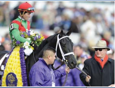
PLUCK - out of South African bred mare SECRET HEART (SAF) - winner of the $1 million Breeders' Cup Juvenile Turf on 6th November 2010.