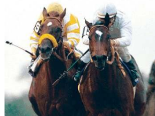
Mr. Greeley (9) in '95 BC Sprint