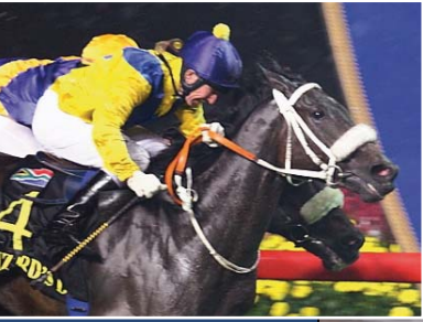
LIZARD'S DESIRE (SAF) - winner of the US$3 million Singapore Airlines Cup G1 in 2010; 2nd US$10 million Dubai World Cup G1 in 2010.