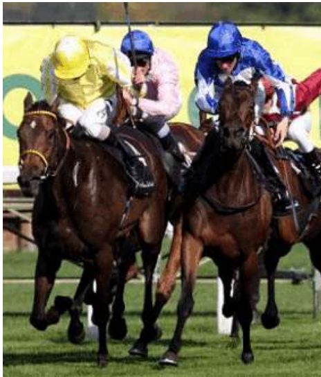
Lady Darshaan (right) shying from Hibaayeb