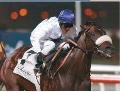
VICTORY MOON (SAF) - Dubai's HORSE OF THE YEAR 2004 - winner of the UAE Guineas and Derby double; 3rd $6 million Dubai World Cup G1.

CAPE TOWN INTERNATIONAL CONVENTION CENTRE JANUARY 27 - 28 · 2011