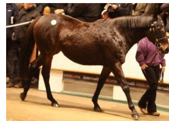
First - lot 1691 tattersalls.com

horses." The Duchess added, "I won't go down to the farm for a while, but there are still some foals at home and a few elderly mares. I'd never sell a mare over [the age of] 16."