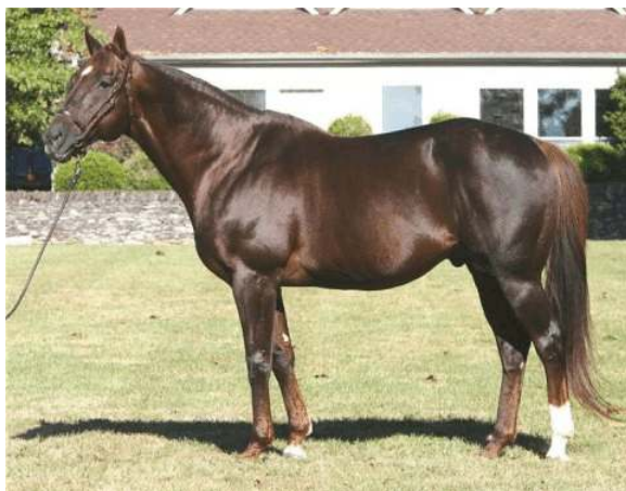
Mr. Greeley (1992-2010)