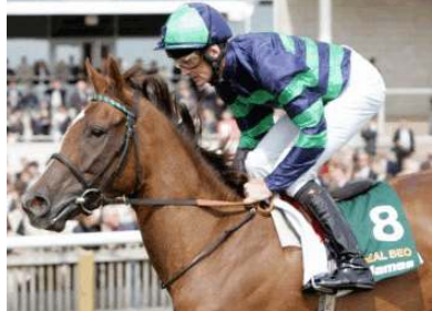
Finsceal Beo

In 2001, Mr. Greeley was moved to Spendthrift Farm before being purchased by Gainesway Farm to stand the 2006 breeding season. He had progeny earnings of at least $3.9 million for eight straight seasons, and exploded as a true international stallion in 2006 with his daughter Finsceal Beo (Ire). A €340,000 GOFORB