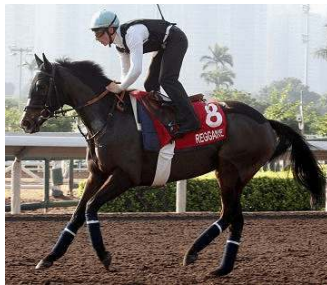
Reggane