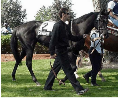
Gandria