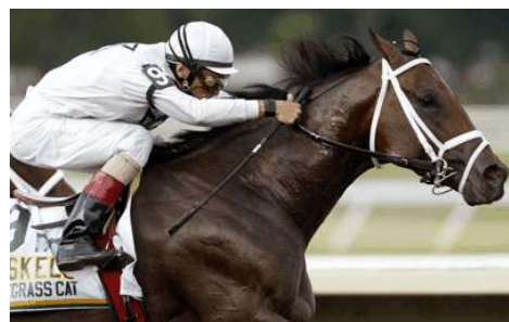
Bluegrass Cat winning the Haskell

Iffraaj (GB) (Zafonic) ran away and hid from the competition as Europe's leading freshman sire in 2010, both by number of winners (37) and progeny earnings ($1,476,576), but the North American earnings title is