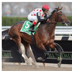
To Honor and Serve

All three sires, incidently, helped their own causes over the past two weeks, and not just through the aforementioned special weight winners. On Nov. 21,