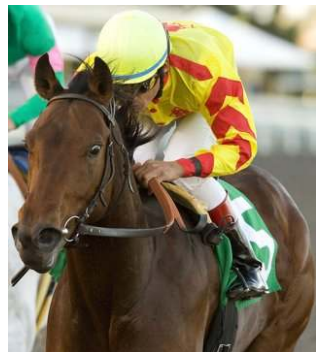
Turbulent Descent

Turbulent Descent (Congrats) looks to up her career unbeaten streak to three while stretching out and trying graded company for the first time in today's GI Hollywood Starlet S. The $160,000 OBSAPR two-year-old turned in a quick winning debut during the Oak Tree meet Oct. 3, earning the field's best Beyer Speed Figure