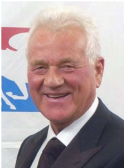
Frank Stronach

The Baltimore Sun has reported that the owners of Laurel Park and Pimlico Race Course are expected to submit a proposed 2011 racing schedule to the Maryland Racing Commission for approval that includes 77 days of live racing concluding after the GI Preakness S. The Maryland Jockey Club's original proposal, which included just 47 race dates, was rejected by the state's racing commission last week, leaving the future of racing in Maryland--and the Preakness S.--up in the air. Frank Stronach, Chairman and CEO of the tracks' majority owner MI Developments, told the Baltimore Sun that he hoped the 77-day schedule would "give