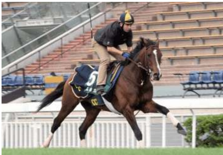
America's lone HKIR hope Winchester (Theatrical {Ire}) gallops Friday at Sha Tin