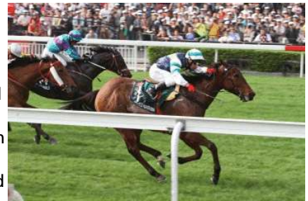
Sacred Kingdom

A trio of domestic victories ensued, and the one-time top-rated turf sprinter was bound for Japan's G1 Takarazuka Kinen last March when he was stricken with a bout of colic and was barely saved.