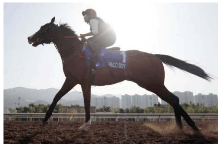
Paco Boy

Paco Boy was thought to be retired after coming up short to the marvelous Goldikova (Ire) (Anabaa) once more in the GI Breeders' Cup Mile at Churchill Nov. 6, but instead will have the opportunity to go out on a high note here. "Everyone knows that Paco Boy is one of our favourite horses, and it would be fantastic if he could finish his career with another