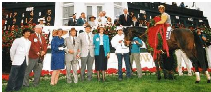
The 1993 Kentucky Derby winner's circle Churchill Downs photo