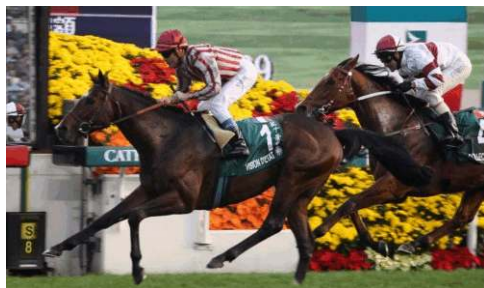
Vision d'Etat & Collection in 2009

Twelve months ago, the connections of Vision d'Etat (Fr) (Chichicastenango {Fr}) were sweating out a Sunday morning veterinary inspection of a swollen right hind fetlock that put his participation in serious doubt. But he passed the vet early that day, and a handful of