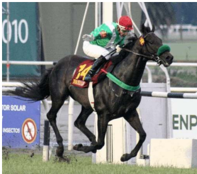
Hipodromo San Isidro photo

Brazilian-bred horses made for a one-two finish in South America's most important race.