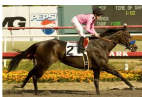
Cost of Freedom