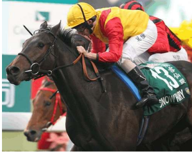
Snow Fairy

Connections then received an invitation to the 11-furlong G1 Queen Elizabeth II Commemorative Cup in Japan, which she duly won (RPR 120), in the process earning a £624,000 bonus, equal to the winner's prize; she added another £900,000 Sunday when she roared from the back of the field off a slow pace to cut down Group 2 winner Irian (Tertullian), with four-time Group 1 winner Vision d'Etat (Chichicastenango), making his final start before