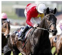
Elusive Pimpernel