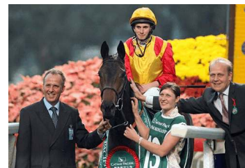
Snow Fairy