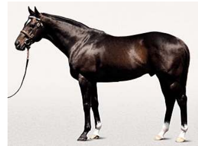
Medaglia d'Oro

As it stands, with just about two weeks left in 2010, Medaglia d'Oro (El Prado {Ire}) leads the stellar studs with $15,355,047 in progeny earnings. Horse of the Year Rachel Alexandra accounts for $3,506,730 of that total, but of course Medaglia d'Oro is no one-trick pony. He sports a co-leading nine graded stakes winners and a co-leading five Grade/Group 1 winners. The following TDN Third-Crop Leaders boxes ( below ) underscore the point.