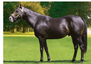
American Post Haras d'Etreham

On the other side of the Atlantic, American Post has put up similar numbers. On the TDN Third-Crop Sire Lists by percentage, he ranks among the Top 10 by black-type winners/foals (6.56 percent), black-type horses/foals (9.84 percent), and graded horses (4.10 percent). A Juddmonte homebred, American Post was