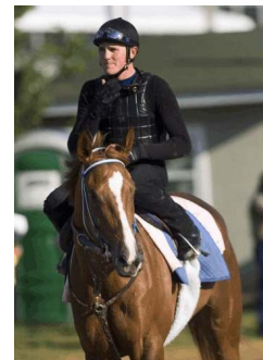
Blind Luck