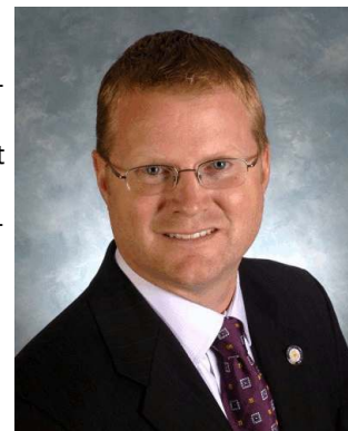
Damon Thayer http://www.lrc.ky.gov/

Kentucky Senator Damon Thayer (R-Georgetown) has prefiled legislation BR 89 to create a National Racing Compact. It would allow for the adoption of uniform rules and regulations between horse racing states. The legislation will be considered during the 2011 Session of the Kentucky General Assembly, which begins Jan. 4. "The thought of the federal government and federal bureaucrats running horse racing is not an approach that I support," Thayer said. "This Compact provides a commonsense solution between total deregulation and opening up the Interstate Horseracing Act of 1978 to allow for federal intervention." Drafted by the Association of Racing Commissioners International, the National Racing Compact was presented to legislators at the 2010 convention of the National Council of State Legislators held in Louisville, Kentucky. Many states are expected to introduce legislation in 2011, including Delaware, Indiana, New Jersey, New York and Virginia. The Compact requires passage in six states to launch. "By adopting the Compact in the next session, Kentucky can become the first state to take a stand on major reforms benefiting horse racing in the entire country," Thayer said. "It is my hope that we can achieve bipartisan support in 2011, and I look forward to working with the many horse racing groups which have a stake in the passage of the Compact."