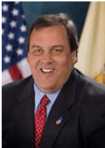
Gov. Chris Christie

(Edited Press Release) New Jersey Governor Chris Christie announced an agreement Friday to keep Standardbred racing at the Meadowlands beginning in January. Through a secured short-term financing plan to