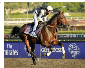
Eldaafer