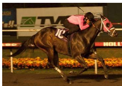
Comma To The Top

The next dam, Maggie's Pistol, was a tough veteran of 28 starts, including 15 as a three-year-old. That