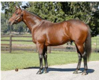
Bwana Charlie journeymanbloodstock.com

Now that Indian Charlie has firmly established himself among the upper echelon of American stallions, with