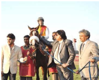
Ocean and Beyond