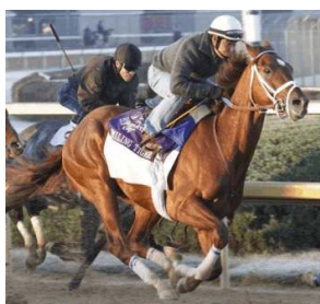
Smiling Tiger

A field of 11 sophomores has been drawn for the final Grade I of 2010, Sunday's $250,000 Malibu S. at Santa Anita. The worthy highweight is Smiling Tiger