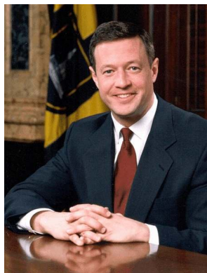
Governor Martin O'Malley