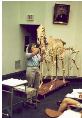
Class in Session