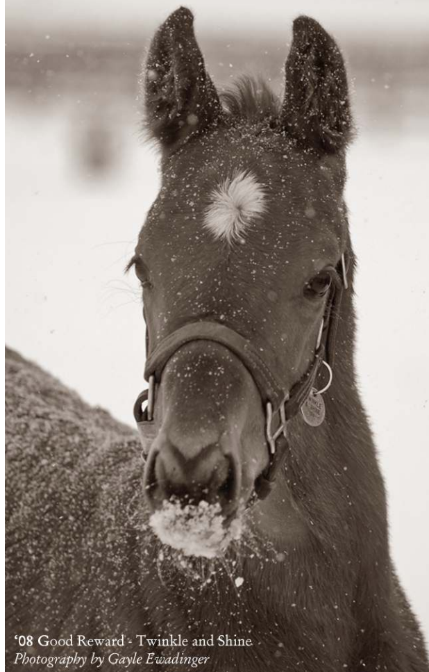
'08 Good Reward - Twinkle and Shine Photography by Gayle Ewadinger