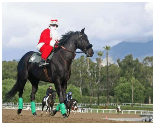
Santa at Santa Anita