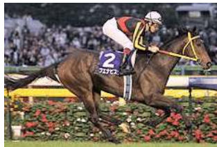
Buena Vista JAIRS

Buena Vista could bury the disappointment of her controversial disqualification from victory in the Nov. 28 G1 Japan Cup with a win here. The four-year-old filly could become just the fifth horse in JRA history to win six Group 1 races and the first female to earn