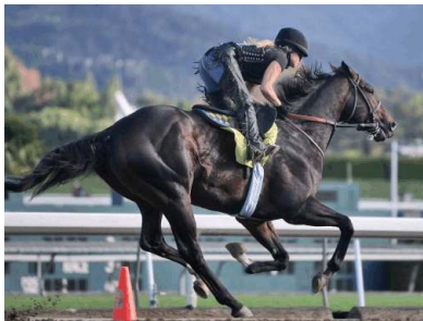
Alcindor breezing Thursday

Thoroughbred Legends shelled out $1.15 million for Alcindor (Unbridled's Song) as a yearling at KEESEP in 2008, and waited over two years for the rangy colt to hit the races. He graduated by a nose at Oak Tree Oct. 23 (video), but hit the sky hook next time going seven panels at Hollywood Nov. 28, when he drew off by 7 1/2 lengths in a first-level allowance (video) in a "TDN Rising Star" performance. Trainer Bob Baffert immediately had this contest as the colt's