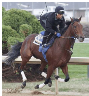
Switch

Switch and multiple Grade I winner Champagne d'Oro will be the worthy favorites, but they'll have to be at their best to prevail in this competitive renewal. "She