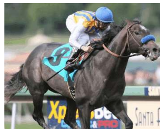
The Factor

The Factor was much-hyped going into his Nov. 28 debut at Hollywood Park, but disappointed when only fourth as the 3-5 favorite.