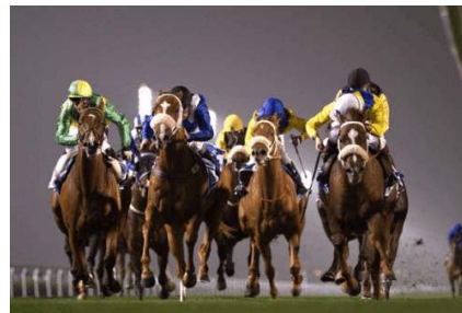
Imbongi (far right) winning the Zabeel Mile

The New Year's Eve program at Jebel Ali has attracted Imbongi (SAf) (Russian Revival), who makes an early reappearance as he prepares for the start of the Dubai International Racing Carnival in a few weeks' time.