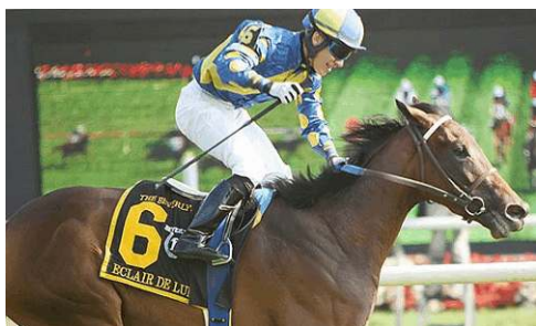
Eclair de Lune likely out of today's GII Robert J. Frankel