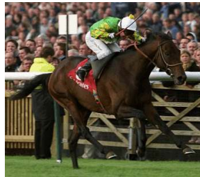
Rakti (1999-2010)