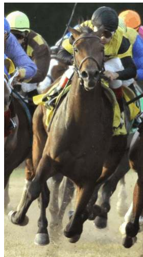
King Congie

King Congie kicked off his career at Saratoga on the GI Travers S. undercard, but wound up eighth, 20 lengths behind runaway winner and TDN Rising Star Uncle Mo (Indian Charlie). The dark bay was then fourth to another TDN Rising Star in Fort