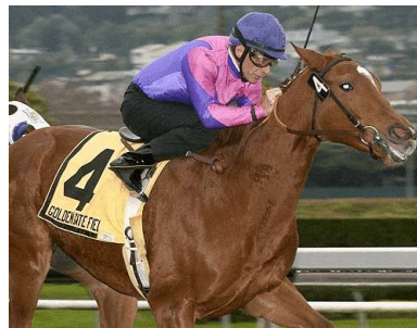
Lilacs and Lace

Lilacs and Lace improved with every start, and earned her diploma in a one-mile maiden over this Tapeta surface Oct. 27. She had the lead in Golden Gate's Corte Madera S. Dec. 4, but couldn't hold off Cathy's Crunches and wound up dead-heating for second with