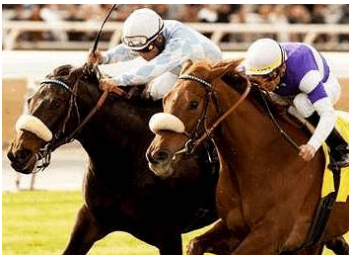
Spring Style (right)

Spring Style (Ire) (Pivotal {GB}) returned to her favorite venue and got her nose down ahead of odds-on Harmonious (Dynaformer) for a career best in Saturday's GII Robert J. Frankel S. at Santa Anita. Winner of a second-level allowance last January, the chestnut