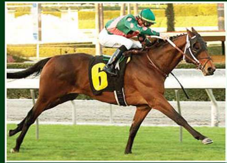
Badge of Silver's 1st Crop son SILVER MEDALLION takes Santa Anita's Eddie Logan S. on 12/31/10

NO OTHER FRESHMAN SIRE... ENDED 2010 HOTTER BEGAN 2011 BETTER