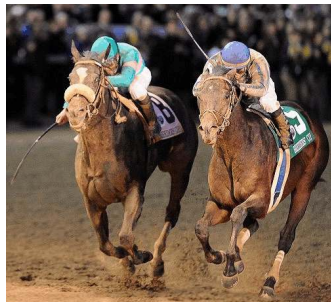
Blame (inside) & Zenyatta

Led by Horse of the Year finalists Blame (Arch), Goldikova (Ire) (Anabaa) and Zenyatta (Street Cry {Ire}), the National Thoroughbred Racing Association, Daily Racing Form and the National Turf Writers and Broadcasters yesterday announced the finalists for 2010