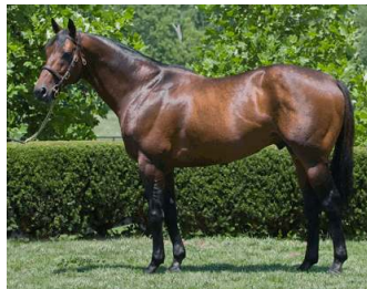
Badge of Silver