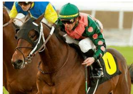
Silver Medallion Benoit