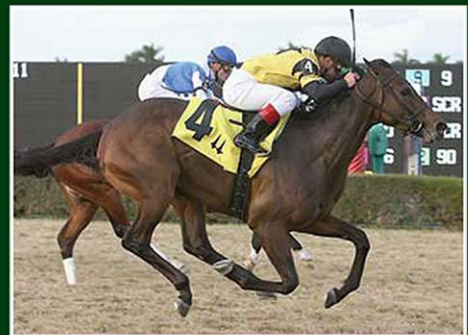
Badge of Silver's 1st Crop son KING CONGIE pulls away in the $100,000 Tropical Park Derby on 1/1/11

Sire of TWO major First-Crop Stakes Winners in less than 24 hours.