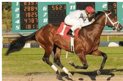
Rule

WinStar Farm homebred Rule (Roman Ruler), off since a third-place finish as the 9-5 favorite in the GI Florida Derby, makes his four-year-old bow in the Hal's Hope. The GIII Delta Jackpot S. and GIII Sam F. Davis S. hero turned in a bullet five-furlong workout in 1:00 4/5 at Palm Meadows Jan. 2. "He was a little subpar coming out of the Florida Derby so we just backed off and here we are,"