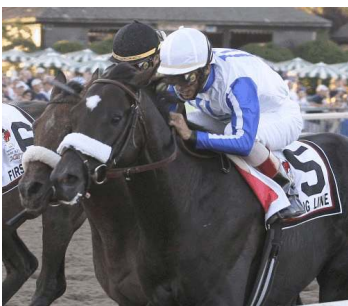
Morning Line (inside)