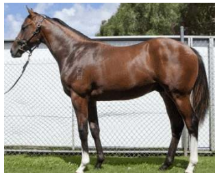
Lot 277 - Redoute's Choice colt

Arrowfield stallion Redoute's Choice (Aus) (Danehill), whose son topped Wednesday's opening session of the Magic Millions Gold Coast Yearling Sale, was responsible for the two highest-priced youngsters during Thursday's action as well.