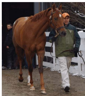
Biz Jet

Warrendale and Live Oak also teamed for the day's second-highest-priced mare. Hip 1381 , the four-year-old filly Biz Jet (Brz) (Smarty Jones--Sweet Eternity {Brz}, by Effervescing), sold for $57,000. Warrendale consigned the filly, a 5 1/2-length maiden special winner at Gulfstream last March, on behalf of Live Oak and Stud TNT. The latter operation signed the ticket for Biz Jet, whom they bred in Brazil. Biz Jet is daughter of Brazilian Horse of the Year Sweet Eternity (Brz) (Effervescing) and a half-sister to GSP Princesa Rafaela (Woodman).