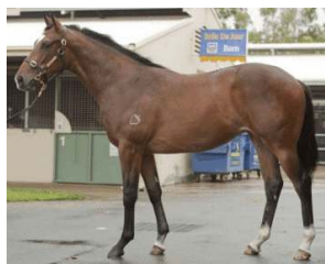
Lot 377 - Redoute's Choice filly magicmillions.com.au

The top filly, meanwhile, is the first foal from Mirror Mirror (Aus) (Dehere), a solid juvenile during the 2005-06 season who bankrolled A$623,180.