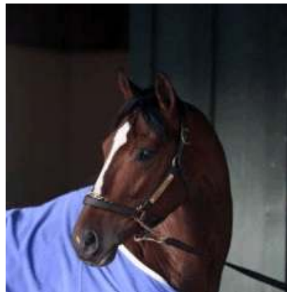
Tapizar

He's fresh off an overwhelming maiden victory at Churchill Downs Nov. 27, but, that fact notwithstanding, Winchell Thoroughbreds LLC's Tapizar (Tapit) will take all the beating in today's GIII Sham S. at Santa Anita. From the deep and talented Winchell family of