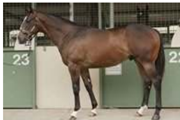
Lot 564 - Redoute's Choice colt