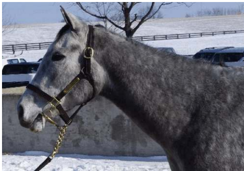
$800,000 Wickedly Perfect

Topping the January Sale was the Three Chimneys Sales-consigned Ave (GB) (Danehill Dancer {Ire}), who elicited a bid of $1.4 million from Shadai Farm. Ave was one of three Grade I-winning racing or broodmare prospects to sell at January. The other two brought