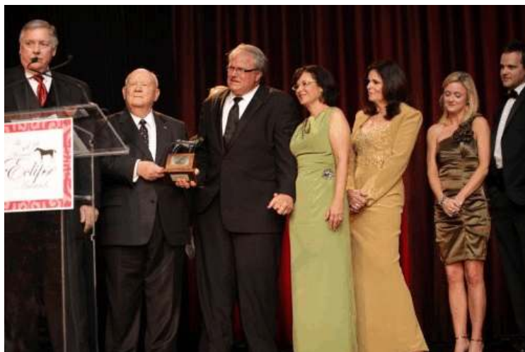
Team Dubai Majesty