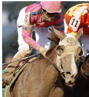
Blind Luck

Last year's champion sophomore filly Blind Luck (Pollard's Vision) may be travelling for her next start after