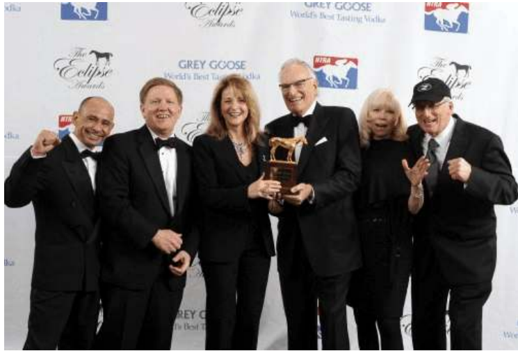
Team Zenyatta celebrate 2010 Horse of the Year victory

Monday, January 17 • Fontainebleau Hotel, Miami