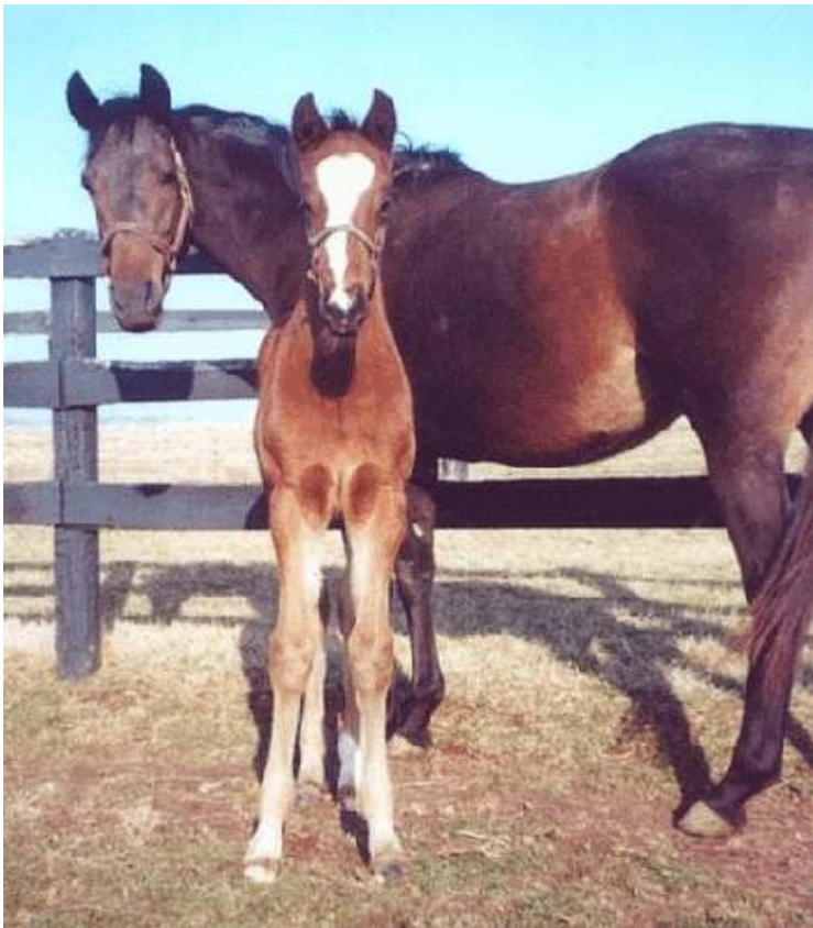
Pollard's Vision--with both eyes--as a foal at Wintergreen

True, none of those have won a graded race other than Blind Luck, but his now four-year-old colt Air Crew has been hard-trying type overseas, winning a third of his 24 races and accounting for four stakes races. In fact, most of Pollard's Vision's stock appears to be plenty sound. His daughter Vertical Vision made seven starts at two, winning a pair of Prairie Meadows stakes, then made nine starts in 2010, just like Blind Luck. She didn't win as a three-year-old, but did hit the board five times in black-type events, including a near-miss second to the good Decelerator (Dehere) in the one-mile Instant Racing S. at Oaklawn in April. Another daughter, Fuzzy Britches, made 12 starts last year. Second in the 2009 GII Demoiselle S. as a juvenile, she went on to capture the 2010 Dearly Precious S. at Aqueduct and finish third in the GIII Dogwood S. at Churchill.