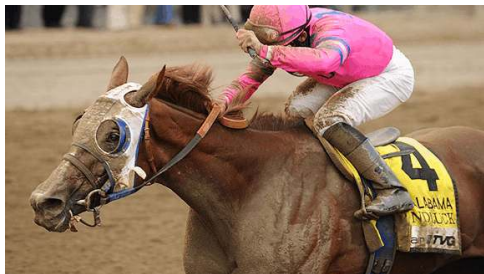
Blind Luck in the Alabama

Now, back to the current third-crop sires, the intended focus of this week's column. The Eclipse Awards were held Monday night in Miami, with Zenyatta (Street Cry {Ire}) walking away as the big winner, taking home Horse of the Year honors by a relatively solid margin--128 votes to Blame (Arch)'s 102--and her third straight Eclipse for champion older female.