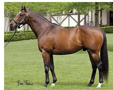
Pollard's Vision wintergreenstallionstation.com