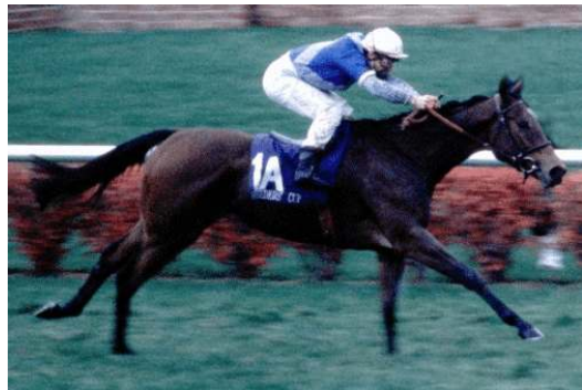
Miesque (1984-2011)

Freddie Head, who was Miesque's regular rider before