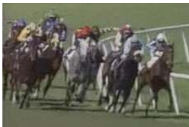
Miesque getting through on the rail in the '87 BC Mile at Hollywood

Miesque warmed up for her sophomore season with an easy score in the Listed Prix Imprudence Apr. 3, then crossed the Channel to top Milligram once again in the G1 1000 Guineas Apr. 30 at Newmarket. She returned home to annex the G1 Poule d'Essai des Pouliches May 17, becoming the second filly--the first since Imprudence in 1947--to capture those two Classics. Boutin stretched her out to 1 5/16 miles for the G1 Prix de Diane the following month at Chantilly, but Miesque could only manage second to Indian Skimmer