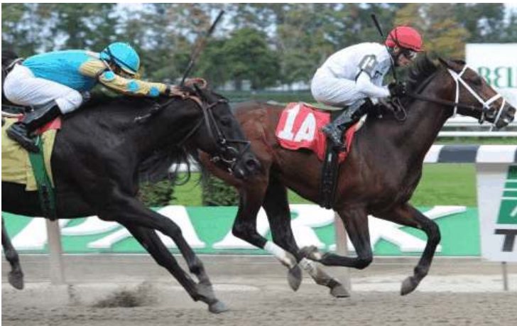
Black N Beauty finishing second to Brethren at Belmont

It's been a bit of a slow burn for Black N Beauty, who is trained by Dale Romans (Todd Pletcher trained Eskendereya). He was a 7-2 chance at first asking in a 5 1/2-furlong Belmont maiden Sept. 4, and came home fourth, beaten 5 1/4 lengths.