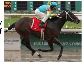
Justin Phillip

Zayat Stables' Justin Phillip (First Samurai) headlines a five-horse field in today's feature at Fair Grounds, the GIII Lecomte S. for three-year-olds. The dark bay will add blinkers despite coming off a victory in his first route attempt over a sloppy local strip on New Year's Day. Sent off the 1-2 favorite that day, he was safely clear of his rivals when he veered out, then ducked back in, giving his backers some anxious moments ( video ). "Ninety percent of the time he's fine," trainer Steve Asmussen told Daily Racing Form . "The other 10 percent, you just don't know." Prior to his Jan. 1 victory, the $400,000 KEESep yearling was third to the highly regarded Brethren (Distorted Humor) in a Churchill allowance Nov. 27. Cont. p6