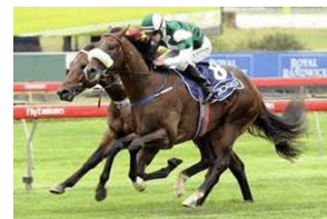
Tickets (near) besting Manhattan Rain