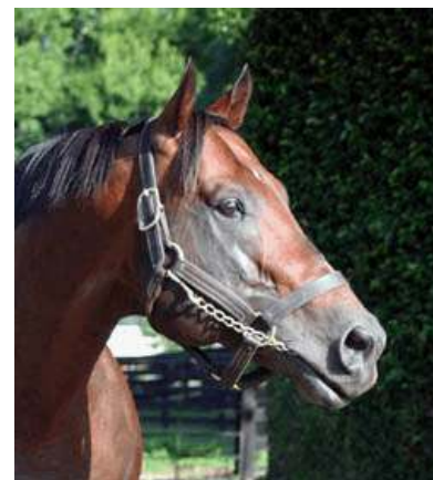
Shining Through's son Strong Hope www.windingoaksfarm.com