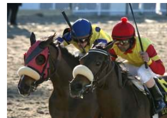
Bouquet Booth (right) holds