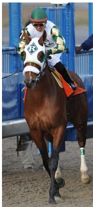
Mucho Macho Man