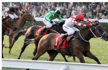
Lucky Nine