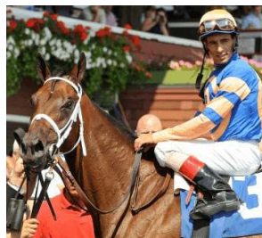
Uncle Mo

The Jockey Club revealed Thursday that Repole Stable's unbeaten champion Uncle Mo (Indian Charlie) has been assigned a ranking of 128 pounds for the 2010 Experimental Free Handicap, two pounds above the