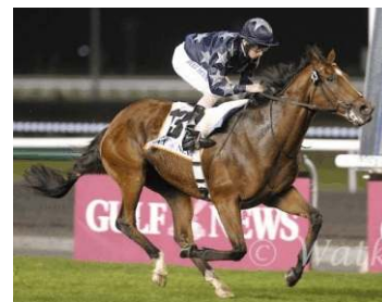
Presvis (GB)

Seven-year-old Presvis (GB) (Sakhee) returned with authority to the site of his last victory--which came in the 2010 G2 Jebel Hatta S. Mar. 4--yesterday in the G2 Al Rashidiya S. at Meydan. Far back in last in the early going here, the veteran slowly crept closer around the bend while full of run with nowhere yet to go. He threaded his way through horses to be fourth when they hit the straight, and emerged from the pack with