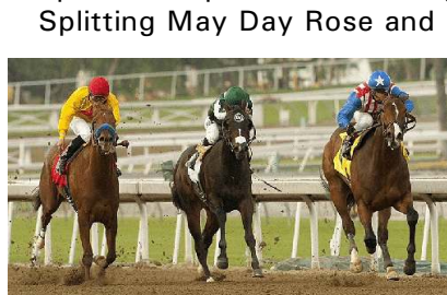
Bluegrass Chatter, Scarlet Starlet & May Day Rose

May Day Rose, incidently, caused a minus win pool-- of over $18,000. She hails from a Bob Baffert barn that can do no wrong at Santa Anita--he was hitting at a 43-percent clip (19/44) heading into Thursday's card.