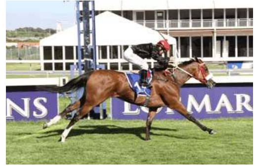
Mother Russia

Recent G1 Queen's Plate heroine Mother Russia is well-weighted to land the event in which she was desperately unlucky to lose in 2010. She was forced to deal with a high draw when she went down by a half-length 12