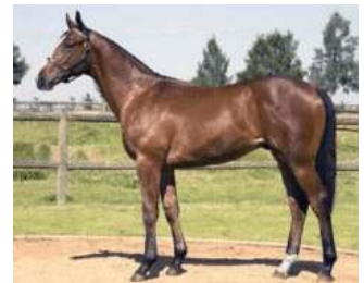
Lot 269 tba.co.za

The inaugural Cape Premier Yearling Sale drew to a close Friday, selling 214 lots for turnover of R87,900,000 (US$12,222,105). There was a clearance rate of 79 percent. The average price was R410,748 ($57,113) (US$1 = R7.192). Leading vendor at the sale, by aggregate, was Klawervlei Stud. They sold 32 yearlings for an aggregate of R15,725,000. Leading vendor, by average (three or more sold), was Lammerskraal. They