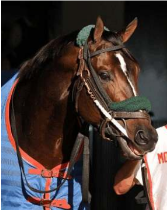
Musket Man