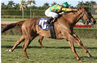
Askbut I Won'ttell Jim Lisa