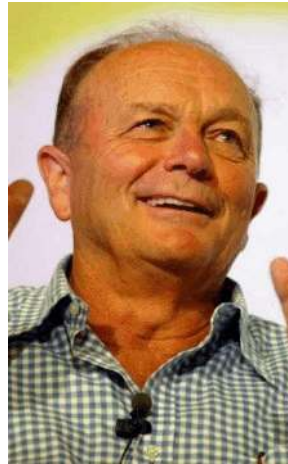
Gerry Harvey theage.com.au

HARVEY ACQUIRES MAGIC MILLIONS ( Edited Press Release ) Prominent Australian businessman and Thoroughbred breeder Gerry Harvey today announced that he and his family have purchased the entire Magic Millions Sales company. "At a meeting held last night,