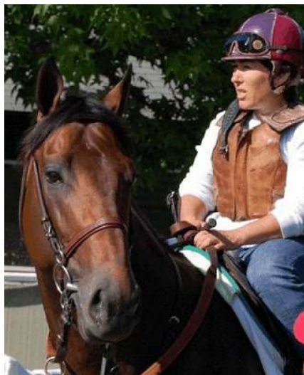
First Dude Sherackatthetrack

GI Preakness runner-up and GI Belmont S. third First Dude (Stephen Got Even) makes his seasonal bow in today's $500,000 Sunshine Millions Classic at