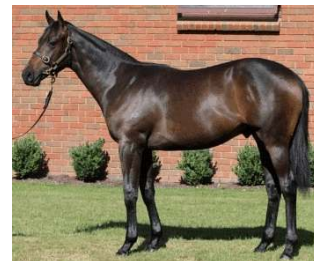
Lot 37 - Zabeel/Seachange colt