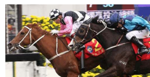
Beauty Flash holds off