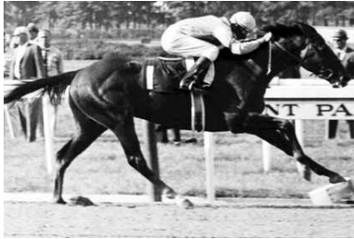
Arts and Letters wins the Belmont