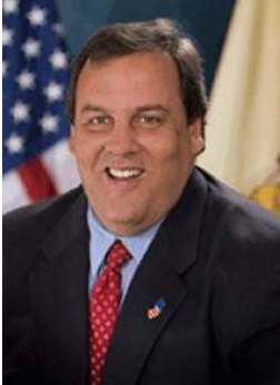
Gov. Chris Christie