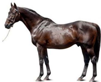
Quiet American darleyamerica.com

Indeed, his total of 18 graded winners in the U.S. and Europe divide very unevenly between the sexes, with fillies outnumbering the males by 13 to five. As many as eight of Quiet American's daughters have scored at either Grade I or Grade II levels, whereas only two of his sons--Real Quiet and Fifty Stars--have achieved that high standard.