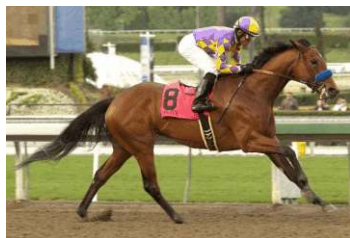
Switch

Switch was bred by Calumet Farm, which used to be home to her broodmare sire Nicholas. The career of this very well-connected son of Danzig was the reverse of