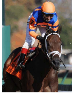
Uncle Mo