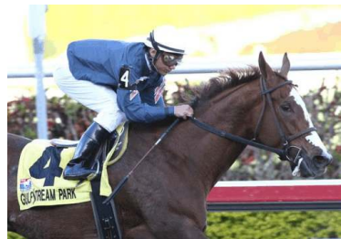
Jessica Is Back