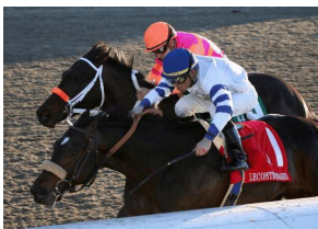
Wilkinson (Rail)