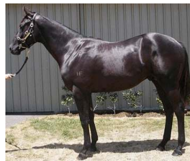
Lot 1575 nzb.co.nz

NZB FESTIVAL SALE CONCLUDES New Zealand Bloodstock's 85th National Yearling Sales Series at Karaka came to a close Monday, with a colt by Don Eduardo (NZ) topping the proceedings. The high-priced