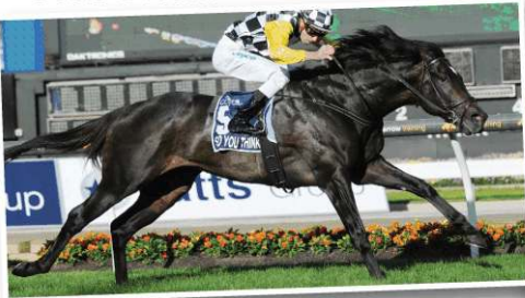
So You Think , joint-top rated Intermediate (9.5-10.5f) turf horse in the World in 2010 with Rip Van Winkle, and has joined Aidan O'Brien for 2011.