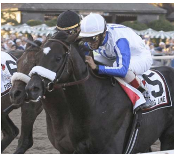
Morning Line