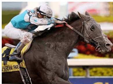
Giant Oak

His fee reflected the fact that his racing career lacked one essential—a stakes victory. Although he had an impressive-sounding record of seven wins, two seconds and a third from 10 starts, only two of those starts had been at stakes level. At three, he had finished third to Distinctive Pro in the Marigold S., a sprint restricted to Florida-breds. More importantly, the four-year-old Crafty Prospector had failed by just a neck to hold the late challenge of the champion filly Christmas Past in a less-than-vintage edition of the GI Gulfstream Park H.