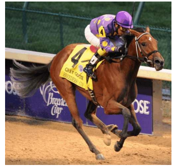
Awesome Feather