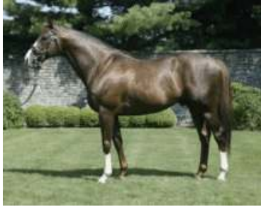
Giant's Causeway

The chances are that his influence will be exerted more by his broodmare daughters than his stallion sons.