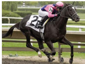
Four Footed Fotos