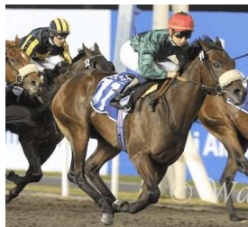
Splash Point A Watkins

Splash Point (Street Cry {Ire}) forged to the lead in the final 200 meters to best Zanzamar (SAf) (Fort Wood) by one length in Thursday's G3 UAE 2000 Guineas at Meydan. Settled near the back of the pack in the early going, the bay narrowed the gap on the front rank 400 meters out. The grandson of