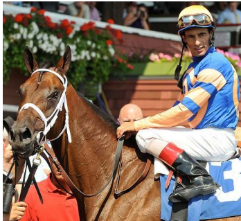
Uncle Mo

Unbeaten champion Uncle Mo (Indian Charlie) heads the list of 364 early nominees to the Triple Crown. The U.S. Classic series kicks off with the GI Kentucky Derby at Churchill Downs May 7, followed by the GI Preakness S. at Pimlico May 21 and the GI Belmont S. June 11. The first nomination phase, when sophomores could be nominated for $600, closed Jan. 22. A late period for nominations--at $6,000 each--will conclude Mar. 26. Four fillies were among the early nominees, topped by Grade I winner Turbulent Descent (Congrats). Just six