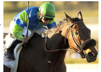
Vision in Gold

But her daughter indeed proved a grand individual, bringing $360,000 from Jay Em Ess Stable at the 2008 Keeneland November Sale. That was the third-highest price for a Medaglia d'Oro that year.