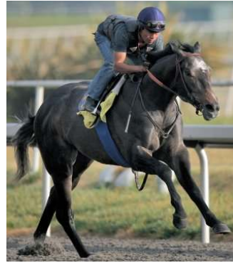
The Factor M Marten

★ "TDN Rising Star" ★ The Factor (War Front), who zipped to a track-record setting maiden win at Santa Anita Dec. 26, will likely make his next start in Sunday's GII San Vicente S. after working seven furlongs at Hollywood Park yesterday in 1:24.40. "Right now, he looks good," trainer Bob Baffert told Daily Racing Form . "The way he looks right now, he'd run unless something changes my mind." Also expected to start in the San Vicente are Zayat Stable's Jaycito (Victory Gallop), Indian Winter (Indian Charlie), City Cool (City Zip), Metropolitan Man (Hook and Ladder), Premier Pegasus (Fusaichi Pegasus), Oakcrest Drive (Arch), Surrey Star (Ire) (Dubawi {Ire}) and Sway Away (Afleet Alex).