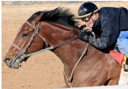
Elite