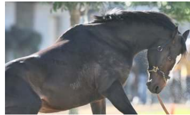
Kinsale King M Marten

Thursday's race, a six-furlong allowance over the Tapeta surface, attracted a field of five older horses.