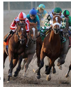
Mucho Macho Man (right)