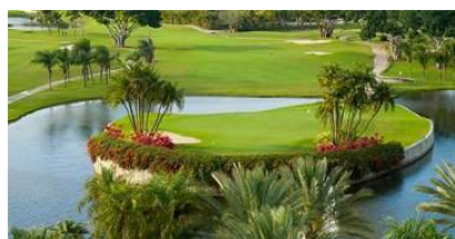
Westin Diplomat Golf Resort

The fourth annual Horsemen's Golf Tournament, which this year benefits the Thoroughbred Retirement Foundation, will be held at the Westin Diplomat Golf Resort in Hallandale Beach, Florida, Tuesday, Mar. 1, 2011. The golf format will be 2-Person Teams, Best