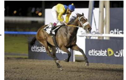
Mahbooba