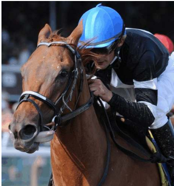
Secret Gypsy winning the GII Honorable Miss H. at the Spa