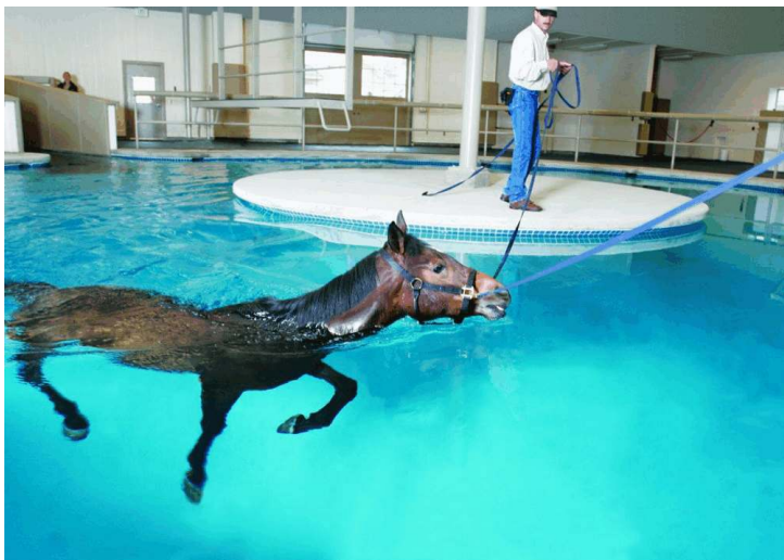
Pegasus Equine Swimming Pool pegasustrainingcenter.com