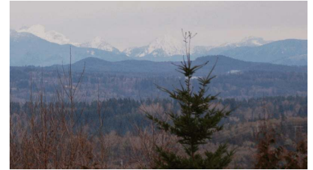
The View from Pegasus

“Without them rehabbing her, she wouldn’t have made it back. She made it back quickly, too--they put her on the fast track back with the hyperbaric chamber and swimming pool, rehabbing her right away; just changing the format a lot from what’s the norm. They were actually swimming her as soon as they took the stitches out in two weeks.”