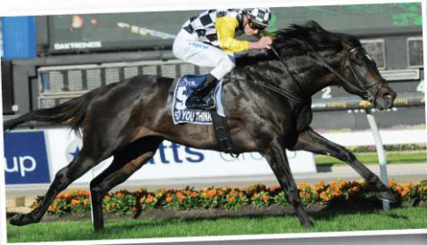
So You Think , joint-top rated Intermediate (9.5-10.5f) turf horse in the World in 2010 with Rip Van Winkle, and has joined Aidan O'Brien for 2011.