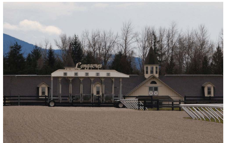
Pegasus Training and Rehabilitation Center