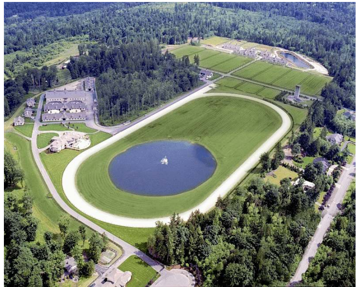
Aerial view of Pegasus pegasustrainingcenter.com

For more information on Pegasus Training and Equine Rehabilitation Center, visit www.pegasustrainingcenter.com or call (425) 898-1060.