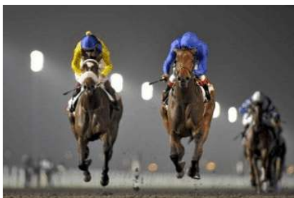
Kwahlah (right) gets the better of Mahbooba

Making her first start over a synthetic surface and having her first run since finishing third in the G3 Oh So Sharp S. at Newmarket last Oct. 1, Godolphin's Kwahlah (Ire) (Cape Cross {Ire}) sat just off the early