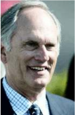
Brereton Jones

JONES RESIGNS AS KEEP CHAIRMAN Former Kentucky Governor and Airdrie Stud owner Brereton Jones has left his post as chairman of the Kentucky Equine Education Project. Jones helped form the lobbying organization, which is committed to educating