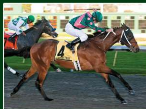
Silver Medallion draws off in the GIII El Camino Real Derby