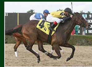
King Congie takes the $100,000 Tropical Park Derby