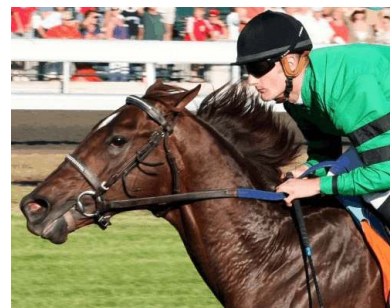
Rogue Romance