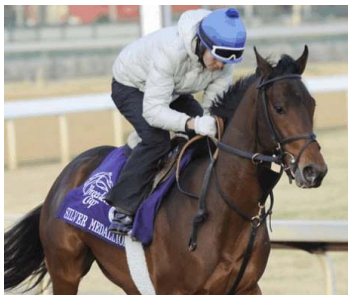
Silver Medallion