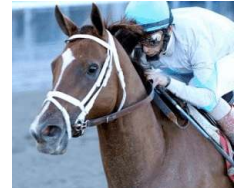
Life At Ten