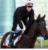
Twice Over