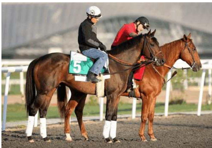
Champ Pegasus getting a touch-up