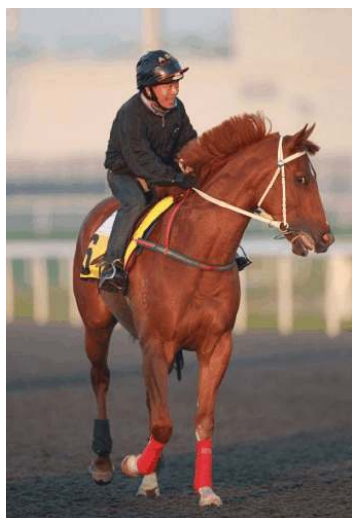
Beauty Flash Horsephotos