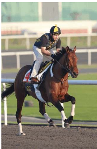
Gio Ponti Horsephotos