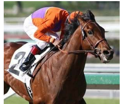
Crown of Thorns

Look for the Ⓚ throughout the TDN graded stakes entries, denoting Keeneland sales graduates.