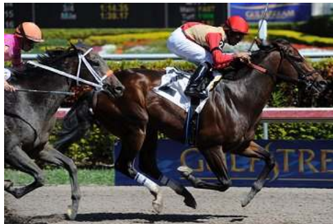
Arch Traveler

Untried in stakes company of any kind, Arch Traveler (Sky Mesa) will go right to the top as he makes his black-type bow in the GI Florida Derby. The bay bids for