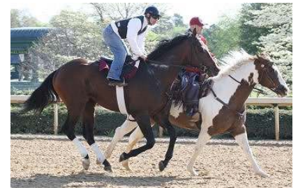
Alternation heads to the pole