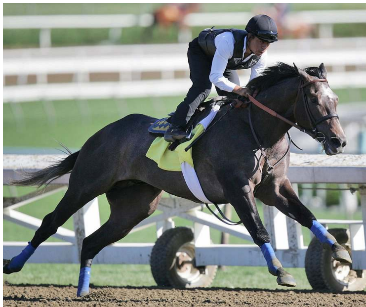
The Factor (War Front) worked six furlongs at Santa Anita Monday in 1:11.40 (4/26) in preparation for the Apr. 16 GI Arkansas Derby.