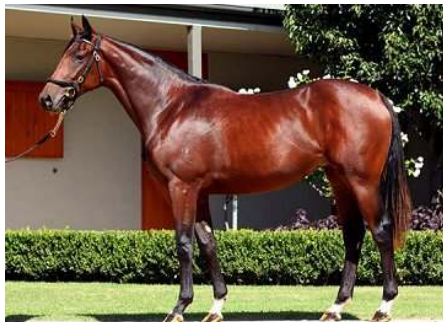
Hip 347 inglis.com.au

There are the offspring of no less than nine champion mares on offer, including a filly by G1 Golden Slipper winner Merlene (Aus) (Danehill). Consigned by Coolmore Stud as lot 347 , the bay is a half to South African MGSW Merlene de