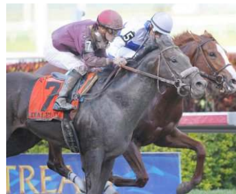
Dialed In