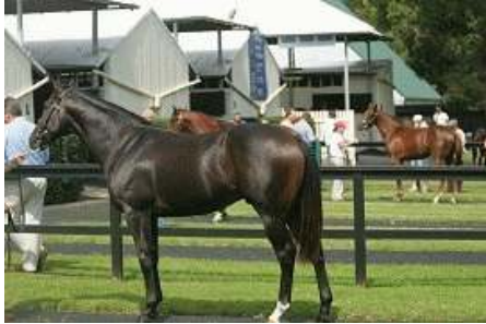
Inglis sale grounds