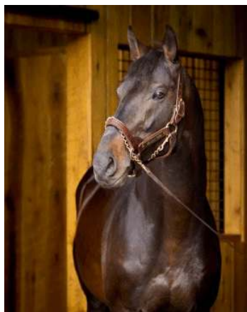
Bellamy Road EquiSport