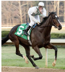
Rachel Alexandra

Among feature races to benefit from the influx of funds was the Southwest S., previously $100,000 and offered a $250,000 in 2011, and the GII Rebel S., which was $200,000 and increased to $300,000 this year.