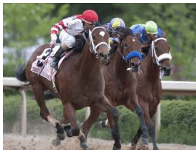
Havre de Grace (outside) Gets Up

Fox Hill Farm's Havre de Grace (Saint Liam) earned her first Grade I victory in yesterday's $500,000 Apple Blossom H. at Oaklawn, turning it on late to win by 3/4 of a length from MGISW Switch (Quiet American). The victoress was bet off the board to be an overwhelming 1-2 favorite, and gave her backers a brief scare turning for home when it seemed as if Switch would prove as tough a foe to down as she had