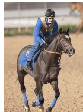
The Factor Gallops at