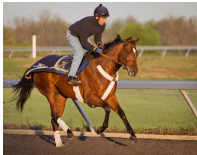
Santiva Gallops at Keeneland