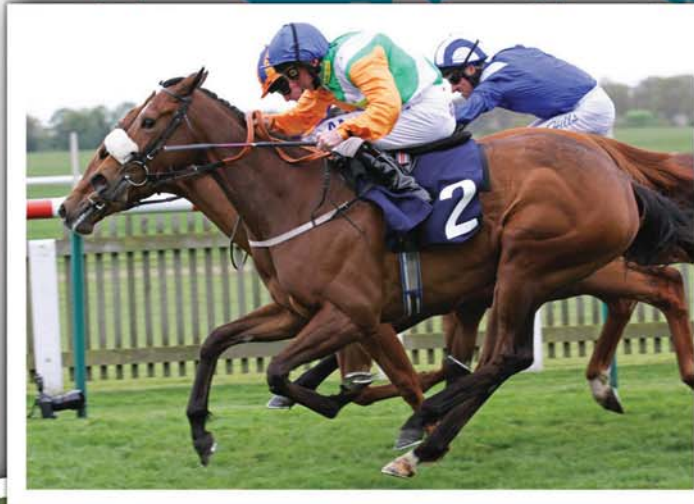
Barefoot Lady ( FOOTSTEPSINTHESAND )