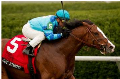
Get Stormy powers clear

Sullimar Stable's Get Stormy (Stormy Atlantic) also secured his first Grade I victory in Friday's Maker's Mark Mile S. at Keeneland over a course that was, fittingly, softened by rain. The 4-1 third choice made all the running, and finished 2 3/4 lengths to the good of Workin For Hops (City Zip).