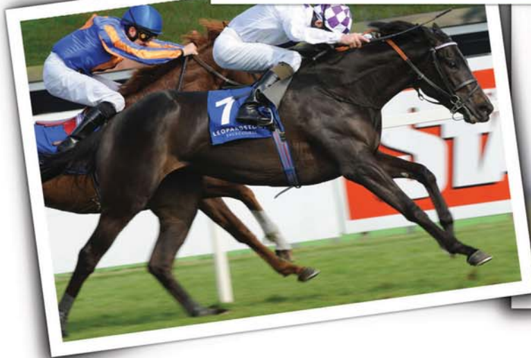
Lolly For Dolly ( ORATORIO )