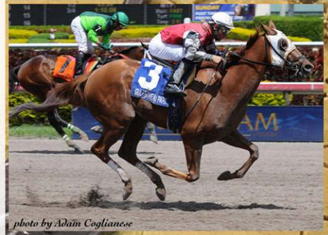
Close It Out wins again at Gulfstream Park

3YO CLOSE IT OUT, winner of Gulfstream’s $75,000 Shake You Down Starter Stakes, has now won 4 of 7 starts and $105,645