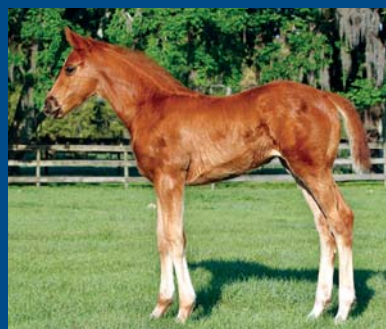
Filly out of Brackenber