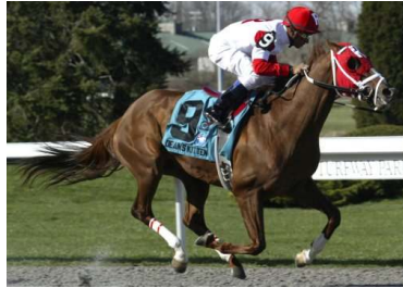
Dean's Kitten