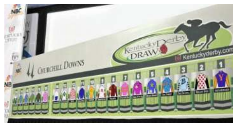
The Derby field