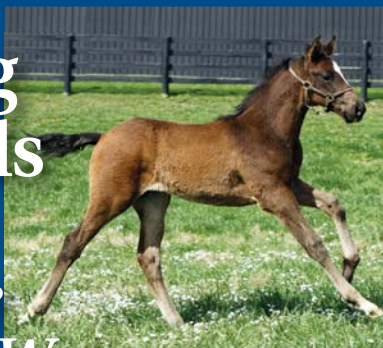
Colt out of Veloce Re

Giant's Causeway – Texas Tammy, by Seeking the Gold