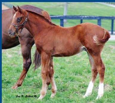
Colt out of Unbridled Rage