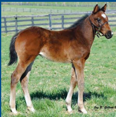
Colt out of Stellar Strength