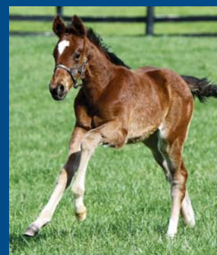
Colt out of Our Resurgence