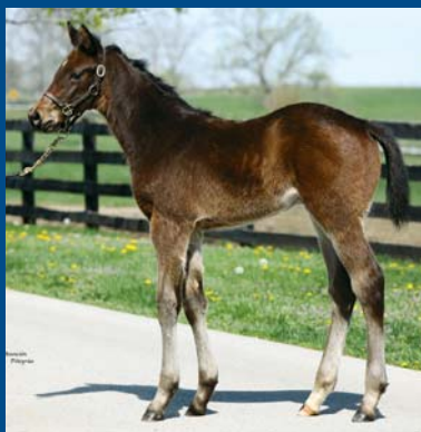
Colt out of Carambola