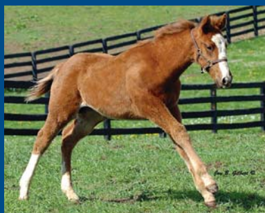
Filly out of New Every Morning