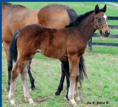
Colt out of Rose City