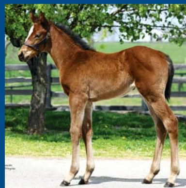
Filly out of Marquee Delivery